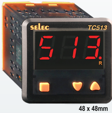
48 x 48mm