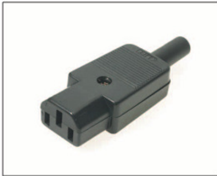
CP22S IEC Power Rewireable Output Connector. Rated 10A / 250VAC.