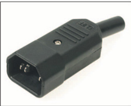
CP22R IEC Power Rewireable Input Connector. Rated 10A / 250VAC.